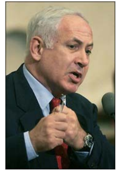
Finance Minister Benjamin Netanyahu addresses the Knesset during the debating of the 2005 state budget...

Slideshow: London Transport System Bombings