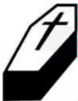
The Queen Mother

THE SIGHT OF thousands of people queuing up to see a royal funeral was a bit hard to take. The media laid it on thick and after a couple of days of people not caring, enough interest was generated to give the few who were bothered the spectacle they so desperately wanted. Those who were masochistic enough to watch were subjected to endless hours of fawning drivel about what a wonderful person the Queen Mother was and how much she did for the country. People can't really be so stupid! Thousands of working class people suffered during WWII while the Queen Mother had all the food and drink she wanted and had a choice of palaces to retreat to. To-