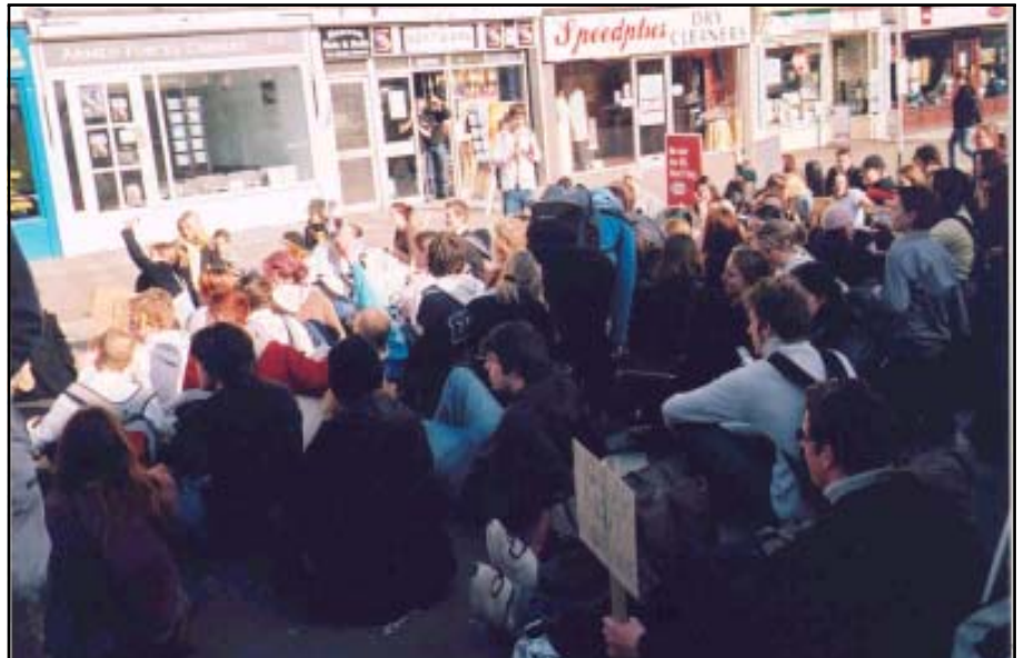
A sit down protest in Commercial Road outside the Armed Forces Careers on the day war broke out

Operation "Iraqi Freedom" has supposedly liberated Iraqi Arabs and Kurds. The trouble is, what freedom and peace can this sort of war bring? It was the creation of Iraq by colonial powers, their backing for Saddam against Iran, the imposition of sanctions when he stopped behaving as the US wanted, and the blind-eye turned to the suffering of Kurds by western governments that has also been responsible for the misery of ordinary people. So this is a war not to right those wrongs but to improve the US economic and political influence in the oil rich region. We all know this, and millions of people have told the UK and US governments "Not In Our Name", but were still unable to stop it. Here in Hereford many anti-war protests brought parts of the city to a standstill (see photo). Meanwhile, not less but more US involvement is called for even by leaders who said they opposed the war, to "restore order". The western and Iraqi middle classes patronisingly call looting unfortunate and misguided. They fail to understand that in the space between repression and poverty under a tyrant and an equally uncertain future, it makes sense to take what you can and need. It is survival, not theft. Of course there are people acting against working class interests – the contract stealing of what should be common resources for personal profit. But government at the point of a US gun has removed opportunities for more constructive self-