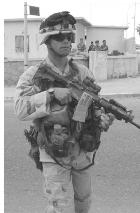
Come prepared: insect repellent, malaria pills and an M16 are essential

All in all I was very sad to be on the plane home. Iraq - a beautiful, historic country. May it never change.