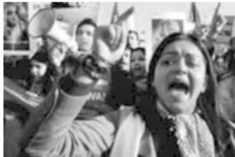
Students delighted at the announcement