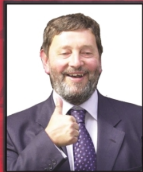
Name: David Blunkett