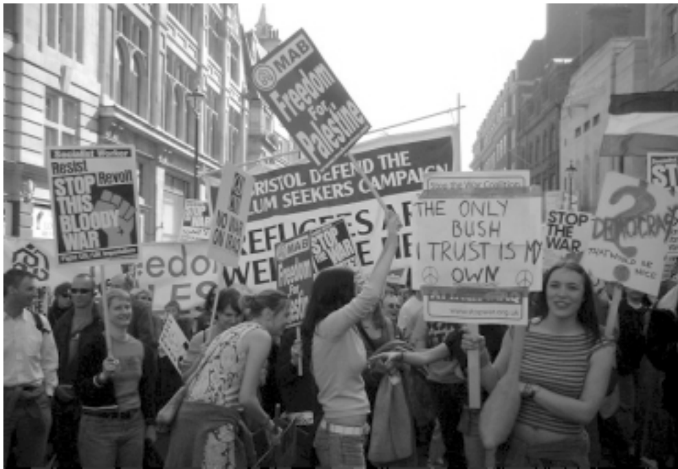
Commiss, students, the unemployed, bleeding heart liberals, do-gooders etc...

To protect our freedom to protest we must first restrict our freedom to protest proclaims police chief