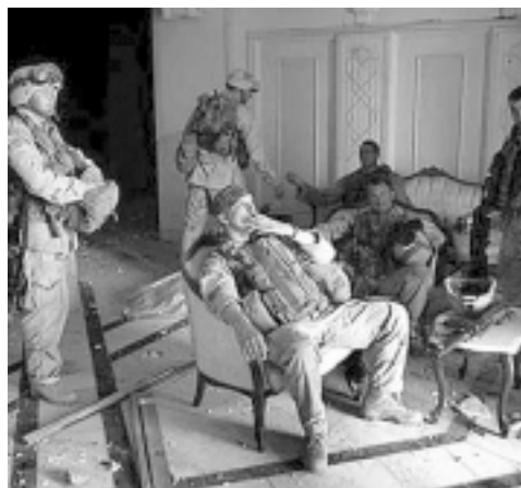
Luxury in downtown Bagdad

To be honest I didn't know what to expect when my editor suggested writing an article on holidaying in Iraq. Images of evil dictators and weapons of mass destruction means Iraq isn't everybody's idea of a relaxing mini-break! But never one to pass up a chance of a free trip abroad, on arrival