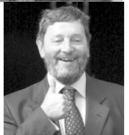
Blunkett: not as mad as he looks (though still quite mad)

Secretary David Blunkett said, "This is the sort of vile, malicious preaching we have to stamp out in this country. I am doing everything I can to prevent people like this from spreading their propaganda, take the new Civil Contingencies Bill, for instance. Freedom of speech can only go so far. If I had my way, and I probably soon will, it would not go very far at all."