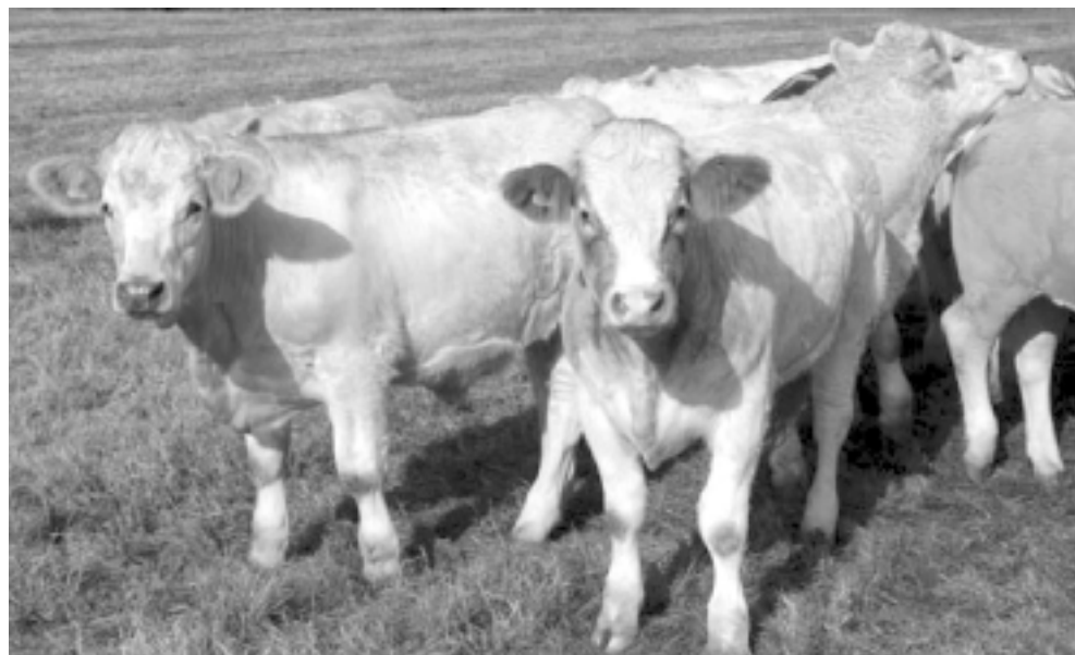
Cattle: actually quite different from asylum seekers

The chief scientist involved in the experiment was yesterday found dead under mysterious circumstances.