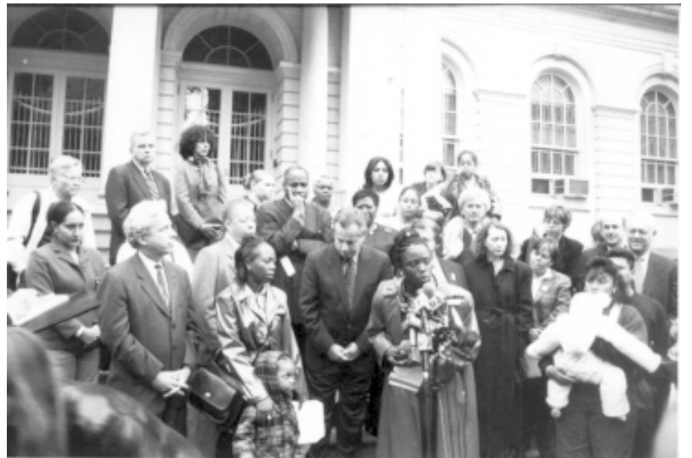
Look: they even look like freaks

The torrent of filth continued as a group spokesperson suggested that if the $800 m spent annually on arms around the globe was targeted elsewhere the world could eliminate hunger, preventable disease and poverty. Commenting on the group's statements, Home