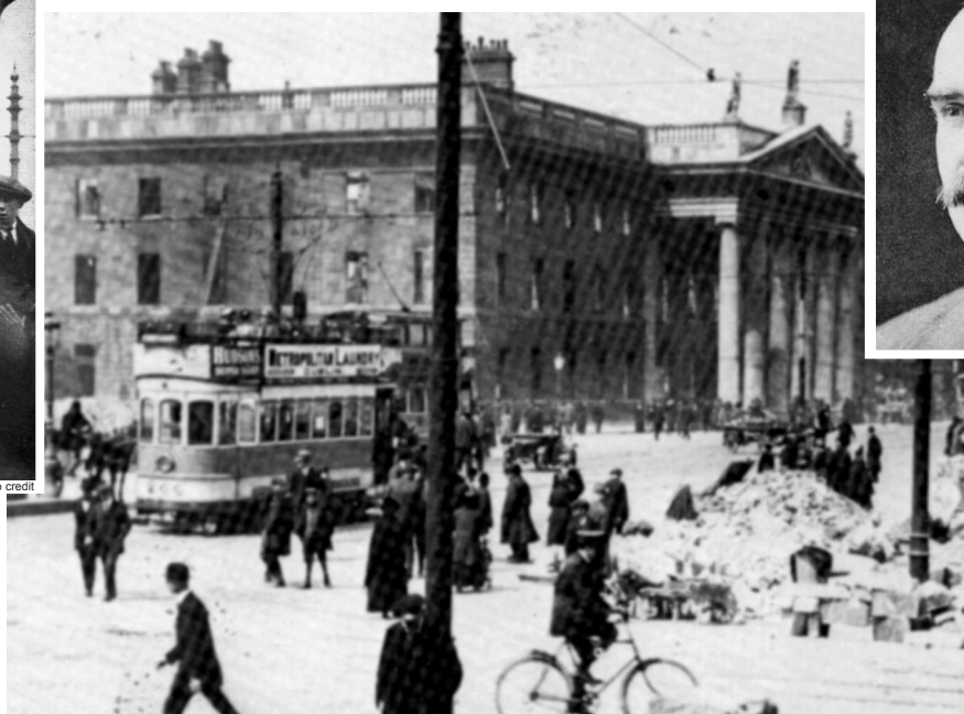
The Dublin General Post Office, a gutted shell after the defeat of the Rising.