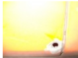
Shot fired at ambulance